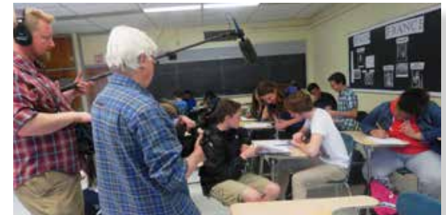
Classroom Close-Up films Italian Heritage Curriculum.

NJIHC has developed a series of lesson plans that help K-12 Italian and social studies instructors better integrate Italian history into their curriculum.