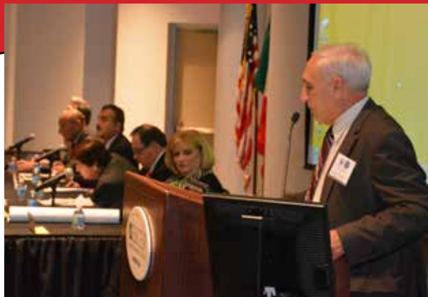
Italian Community Leaders present at Annual Congress.